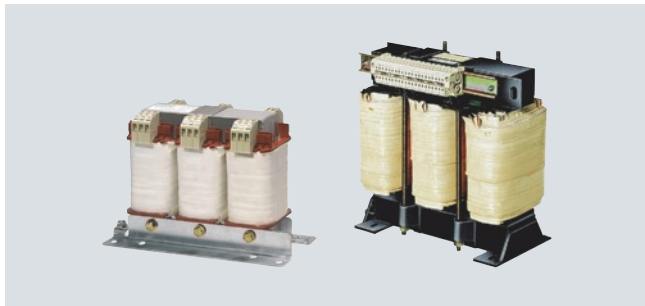
4AP20 (left) and 4AU (right)